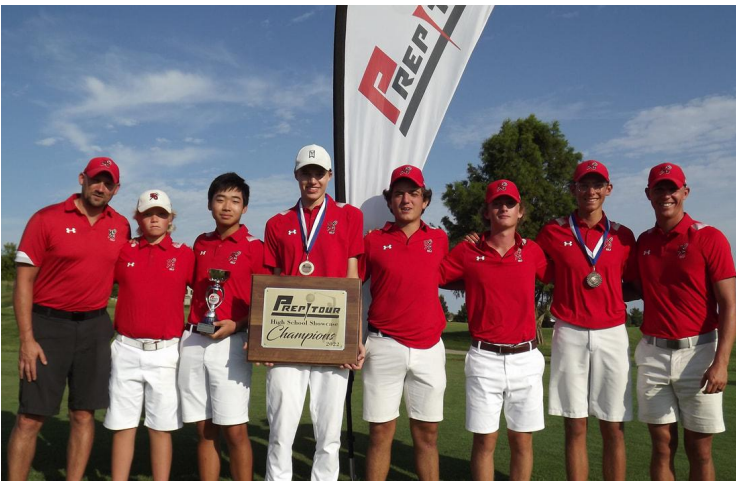
2022 Champion: Hinsdale Central Red Devils

2022 Results: https://www.preptour.com/22-boys-showcase-results.html